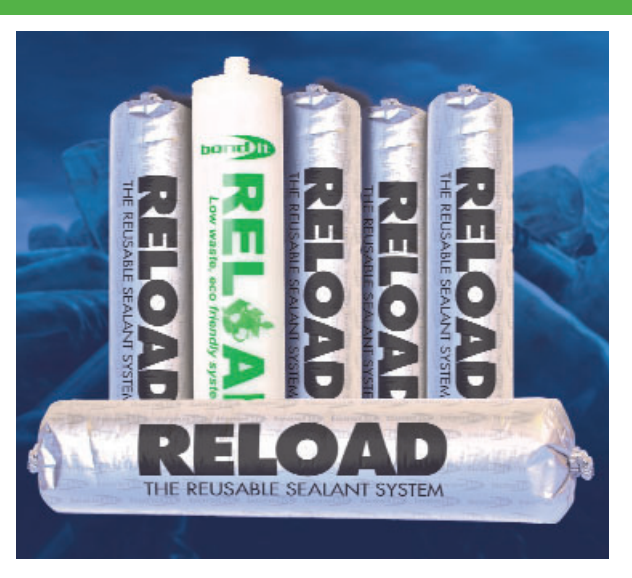
The same trusted formulations but now in EU3 filled aluminium foils:

WP100: A high grade LMN silicone for perimeter sealing of external door and window frames. Rapid curing with good adhesion properties and additional uPVC adhesion promoters. Available in white. Order Code - Refills: RLSWPWH Kits: RLKWPWH