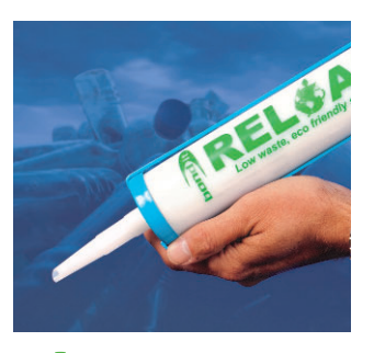
4 Place in extruder and use