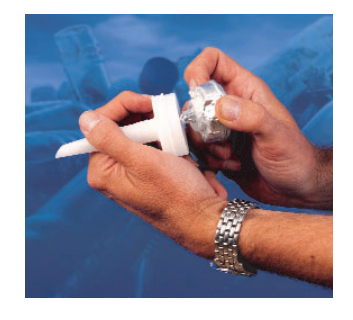
6 Flip the aluminium slug out then RELOAD!