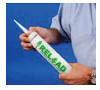
Attach the nozzle