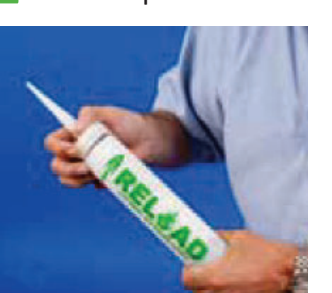
3 Attach nozzle and cut to required angle