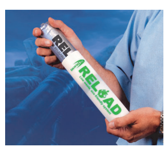
Load the sausage